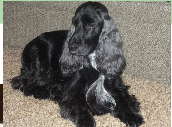
Beautiful Clipper is 11 years old this month! ~Jerabee Golden Gait Eclipse RE CGC ~ Katherine Baumann

Every dog, and especially every senior, is different when it comes to nutrition. Sometimes longevity is simply a matter of good care, good genes, and good luck. But there are some basics that nonetheless apply to all.